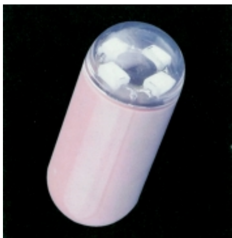
Capsule Endoscope (11mm x 26mm)

At the symposium on obscure gastrointestinal bleeding, Dr. Paul Swain mentioned the latest advances on a new modality of endoscopy, the capsule endoscopy. It is a pill-sized wireless endoscope 11 x 26 mm in size which contains